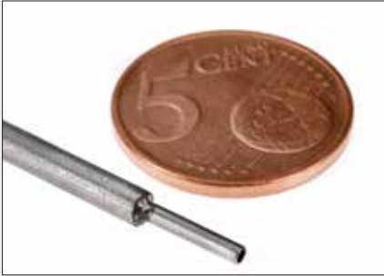
Tight welding of pressure lines