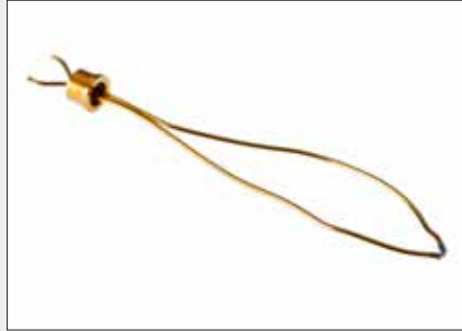
Manufacturing of temperature sensors (Illustration shows gilded platinum sensor)