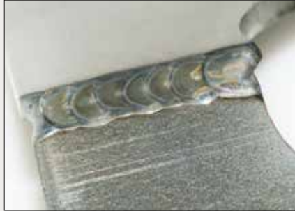
Welded joints of different materials