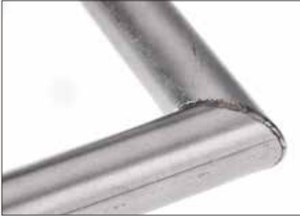
Weld seam for tube corner joint