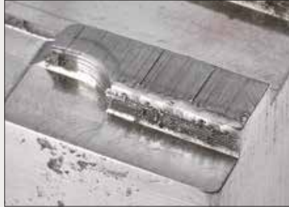
Weld cladding of edges