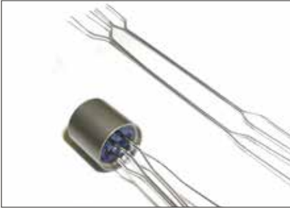
Fine welding of electronic components, e.g., thermocouples